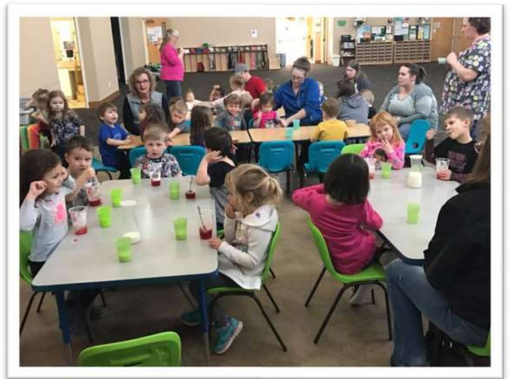
Last Month's Cherry Tree Party